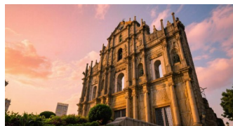
The Ruins of St. Paul's

Macao's rich and varied history has left its mark on the city, with vibrant reminders of its heritage as a Chinese fishing settlement intermingled with landmarks to its past as a Portuguese outpost. Around every corner, the city's unique multicultural character invites visitors to explore and discover new facets of Macao.